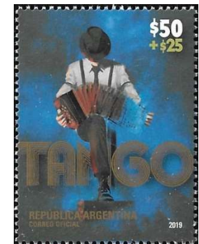
Argentina 2019 Scott # AR 3840