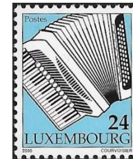
Luxembourg 2000 Scott # LU 1046