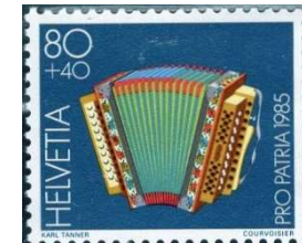
Switzerland 1985 Scott # CH B517