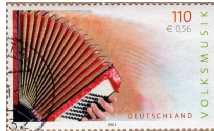
Germany 2001 Scott # DE 2121