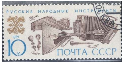
USSR 1989 Scott # 5818