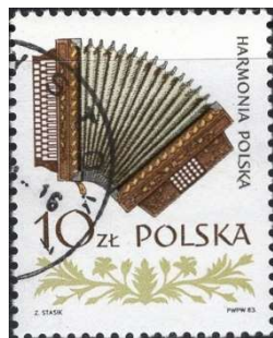
Poland 1984 Scott # PL 2605