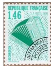
France 1990 Scott # FR 2233