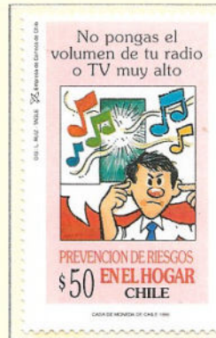
Domestic risk prevention.

Sound pollution is the propagation of noise or sound with ranging impacts on the activity of human or animal life. The source of outdoor noise worldwide is mainly caused by loud music, transportation (traffic, rail, airplanes etc.) explosions and people.