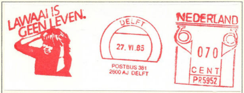
Delft, 27/06/1985. Postalia "PS4", prefix "PR". Noise isn't life.