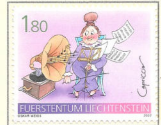
Music yes! Noise no!